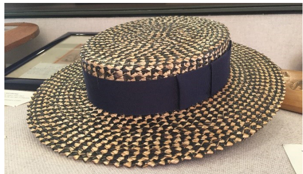
(Above: A surviving speckled hat from the last batch on display at the OSRG.)

Through research, I was able to find out that Harrow did a pretty good job of bringing the speckled hat into the 21st century. Most of the speckled straw boaters also seen at Eastbourne, St Edward's, King's Canterbury and others had mostly faded out by the late 1970s due to the extra labour and the now extinct tradition of hat-wearing.