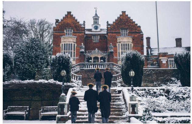
Old Schools, by SWB