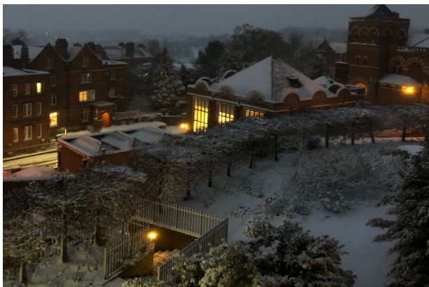
Illuminated Pasmore Gallery, by Theo Nash, The Grove