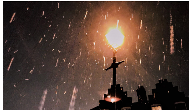
Lamp in front on High Street, by Otto Seymour, Bradlys