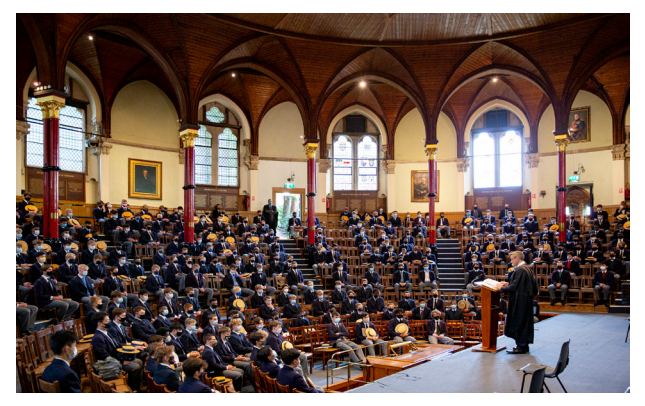
(Above: The first Shells in 2020 in new era of COVID.)

This provision, combined with beaks providing online lessons for children in care, means that the School has helped over 1,000 vulnerable young people this summer.